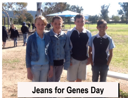
Jeans for Genes Day