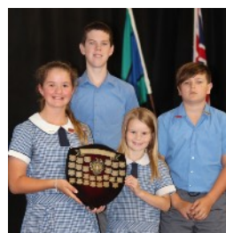
Winning House for 2021 GILL